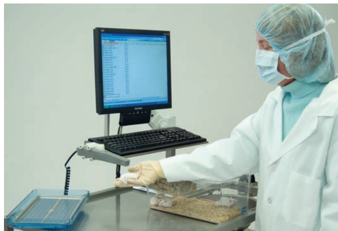
Data is collected with each scan