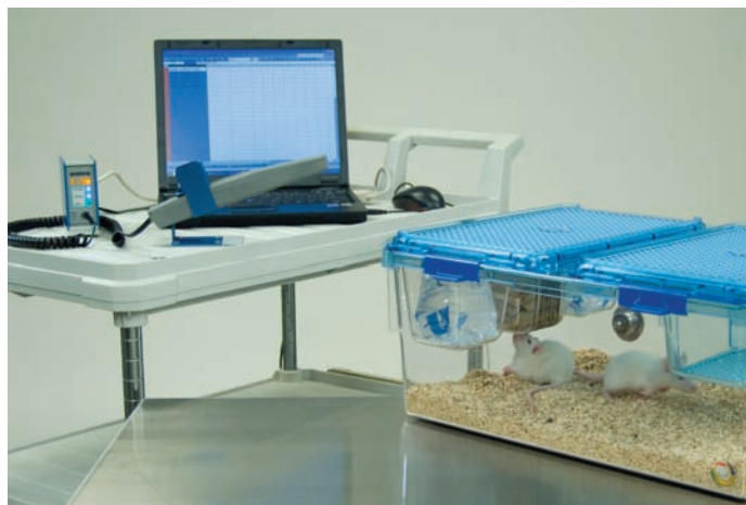
DASHost™ enables easy data integration to your computer