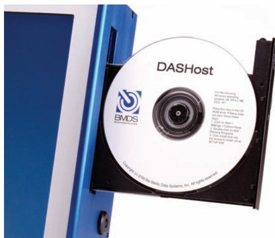
DASHost™ software; simple to install and easy to use