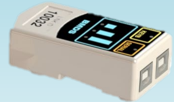
Optional Wireless Communication Module