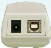
AC Line Power & USB Serial Data Interface

The DAS-8027-IUS Reader is a portable system for reading ID data from, and programming ID data to all BMDS Programmable Transponders (XPT-100, IPT-300, and IPTT-300). The reader can also detect and display calculated temperature from the BMDS patented IPTT-300 transponder.